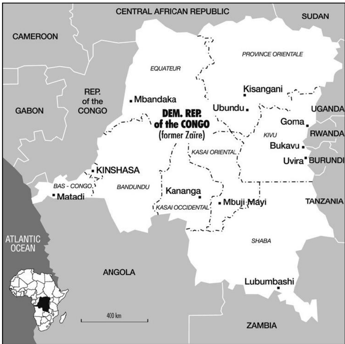
Map of Democratic Republic of the Congo. Country names and borders on this map are intended to facilitate reference and have no political significance